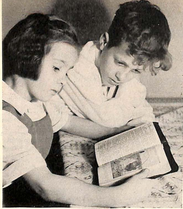
Boys and girls will grow through committing God's Word to memory only if the words have meaning.

The Word of God shall guide my feet, and when thou walkest by the way Wherever I may go;