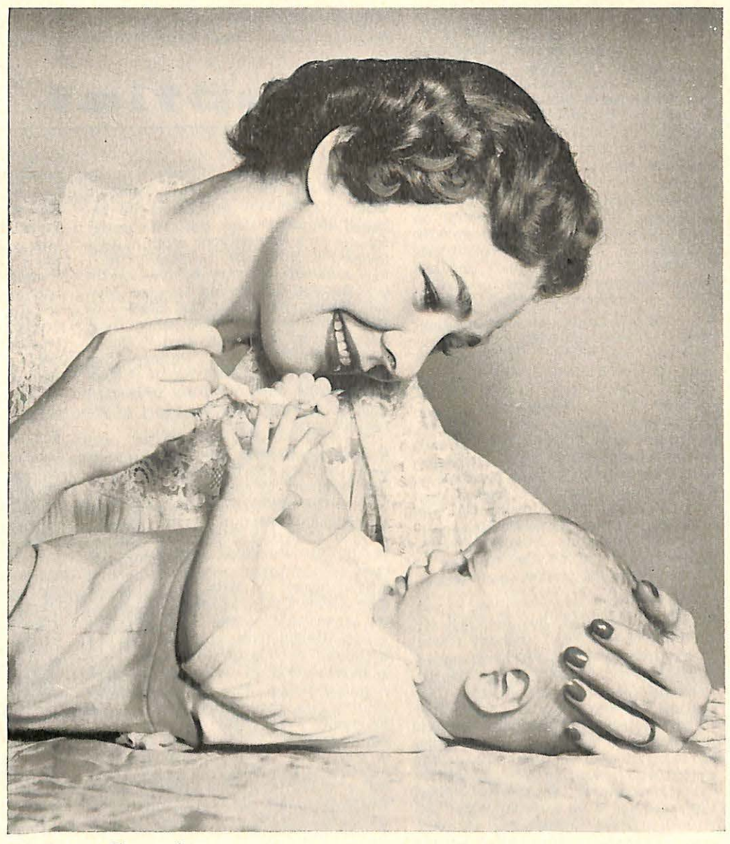
Born to Grow!