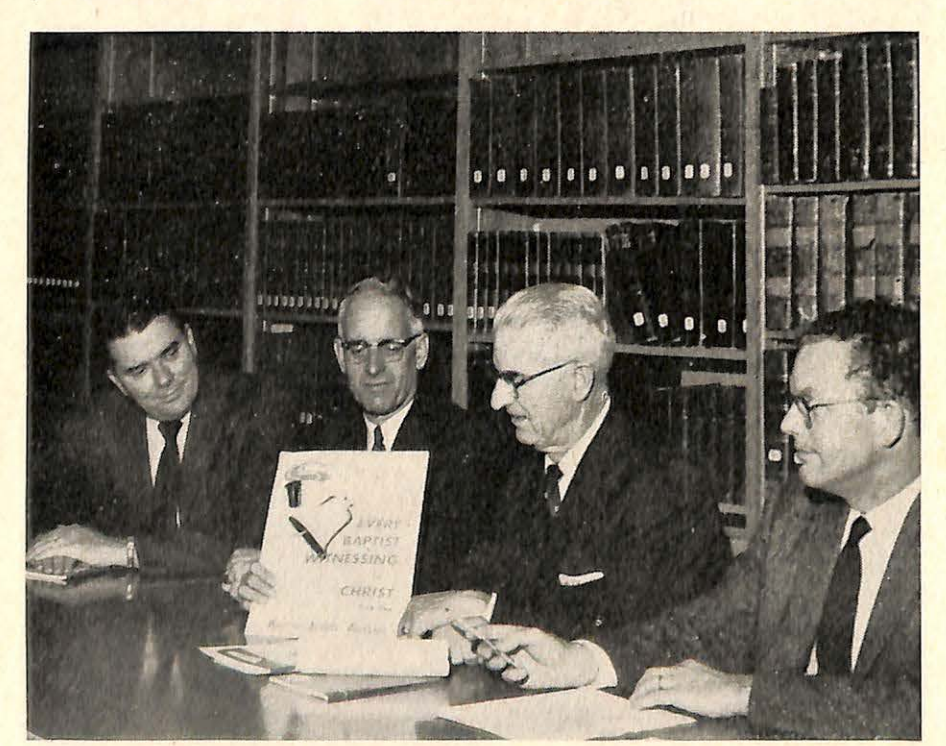
BAPTIST JUBILEE ADVANCE LEADERS

One of the objectives in the Baptist Jubilee Advance program for next year will be a Bible study on Colossians to be held for a week in every North American Baptist church during the first quarter of 1960. The textbook on Colossians is included in the BIBLE READING PACKET. It has