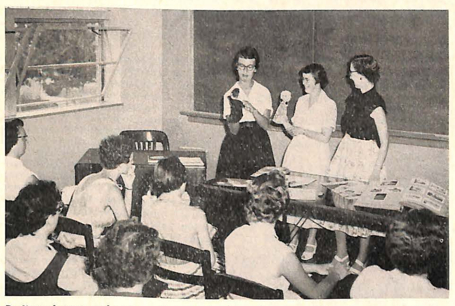
Dedicated men and women in our churches, who are willing to serve as leaders and teachers, need opportunities to develop their abilities and to use Sunday School

followed for your leadership training program. This will require much advance planning in order to avoid conflicts with other meetings in the church and community.