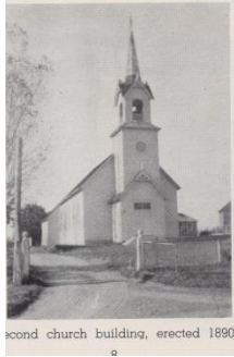
Second church building, erected 1890.