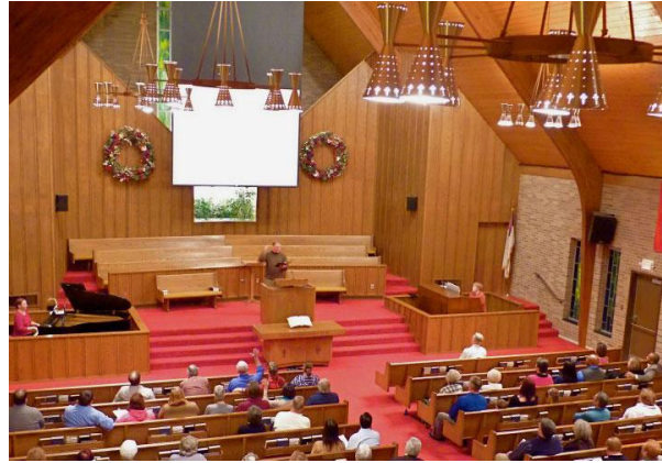
Bethel Baptist – St Clair Shores (web -Nov 2014)