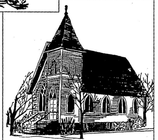
322 8th Street