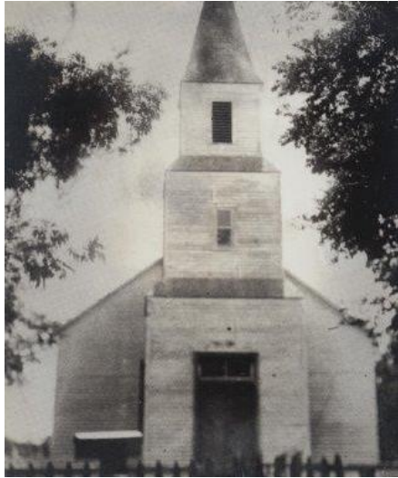
Church building in 1899

Effenberger, Franklin. "History of the Greenvine Baptist Church of Burton, Texas." Typed manuscript with footnotes and references.- late 1980's