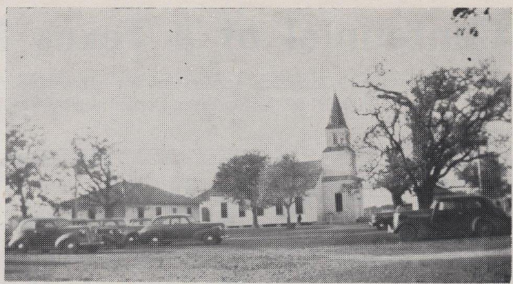
The Greenvine Baptist Church as it looked in 1941 at its eightieth anniversary. The Sunday School building on the left was destroyed by fire in 1960. The steeple and entrance on the main building was replaced by the present entrance in 1951.