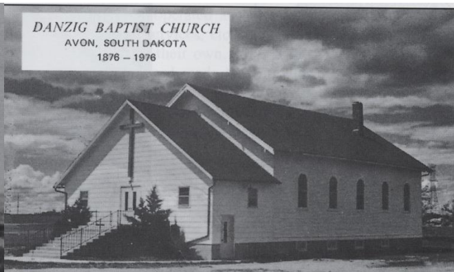
Church with new addition 1967