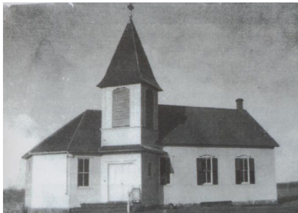
First church built in 1882; burned 1919