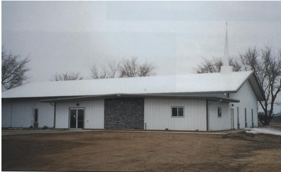
Building built in 1997