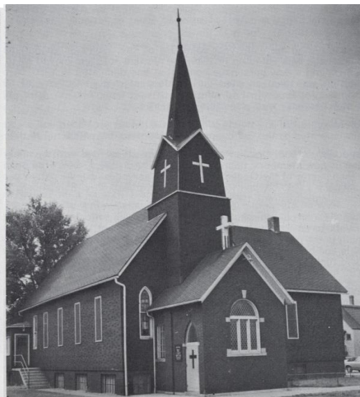
East Side Baptist Church in May, 1971 just before it was taken down to make room for the new church.

First building with addition - 1876-1916