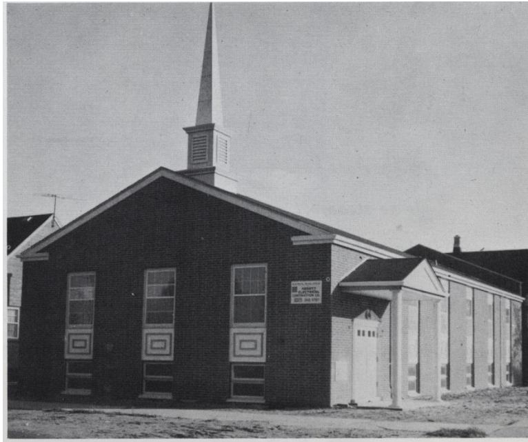
Present building dedicated 1972