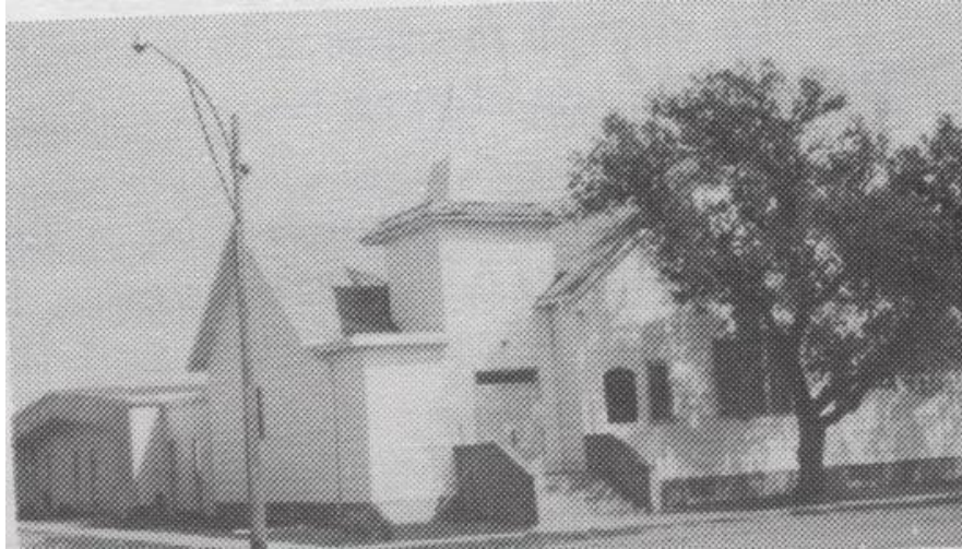
Present building – remodeled in 1975 and addition 1982