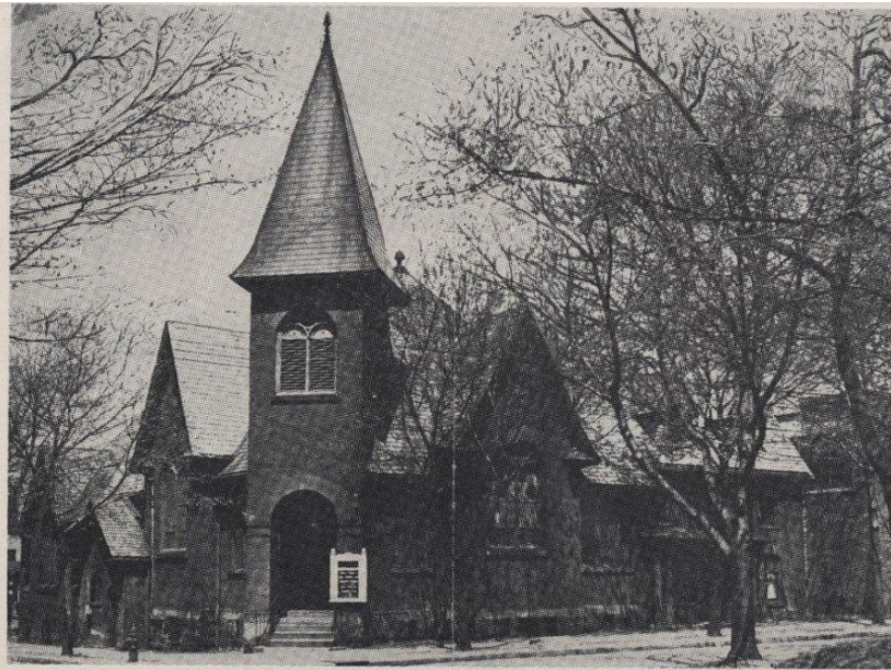
The historical landmark and former building of the Central Baptist Church of Erie, Pa., (now known as the South Hills Church), which was used for many years for worship services.