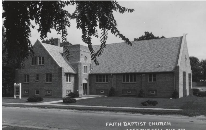
Building dedicated 1954