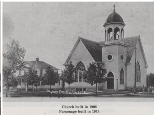
First church as church 1908