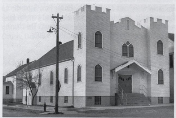
The new Eureka First Baptist Church 1951-1968. (Notice the parsonage to the south of the church, on the left side of photo).