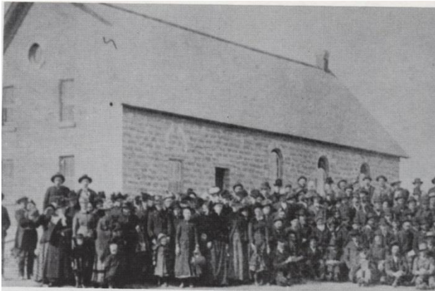
Stone building – native stone 1879-1893