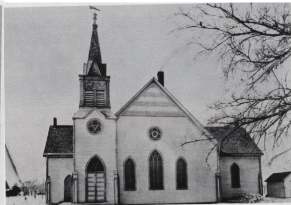
White frame building used 1893-1937