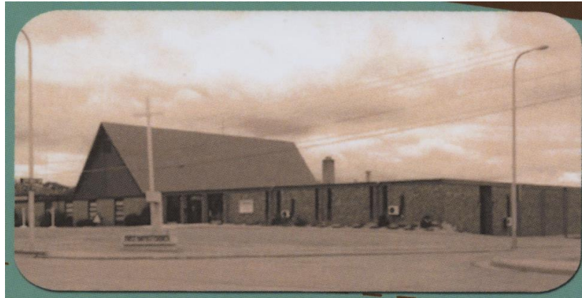
From 125 th anniversary cookbook cover – 2013