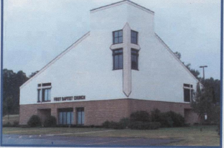
Current church building - dedicated 1986 (from web site)