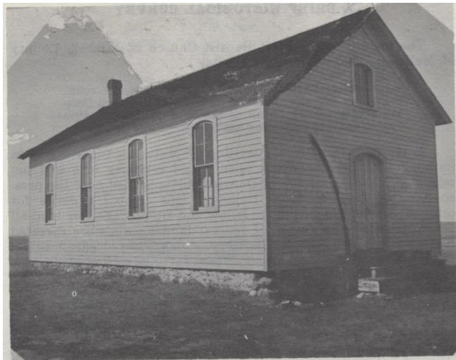
First Baptist Church building erected in area of Moscow Township called the Danzig Church in 1892

Assorted programs, bulletins, and photographs