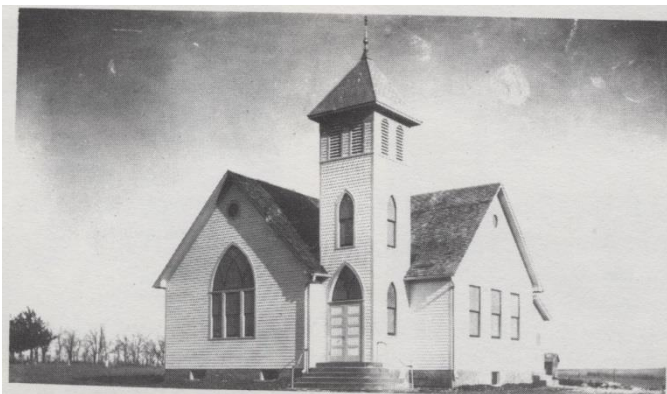
The Church Building in 1916