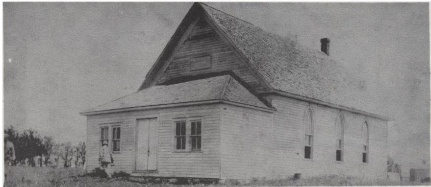
The Church Building in 1882

Highland Baptist Church Centennial Celebration booklet 1881-1981