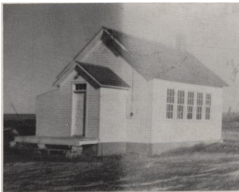
School House, First meeting place, 1904 -----

100 th Anniversary McClusky Bapltist Church 1904-2004