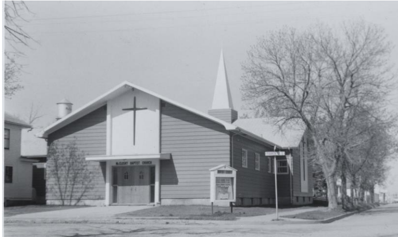
Present church 1965