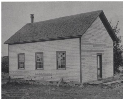
Schoolhouse used 1865-1875

Typed history summary and supporting information 2012.