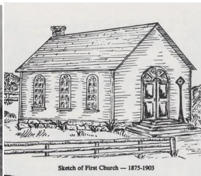
First church structure 1875