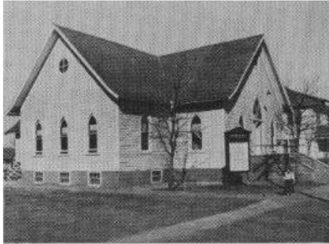
Zion in 1945 –from cover for annual report