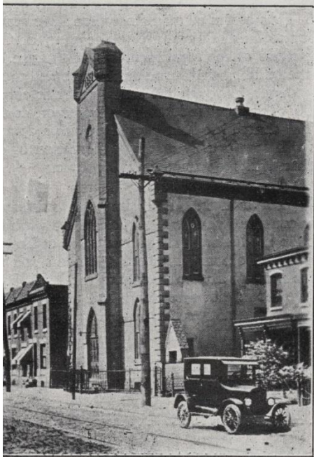
First building 1889-1949

Miscellaneous correspondence; assorted photos