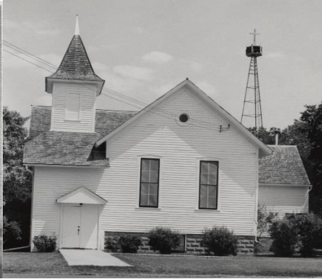
Second church 1925