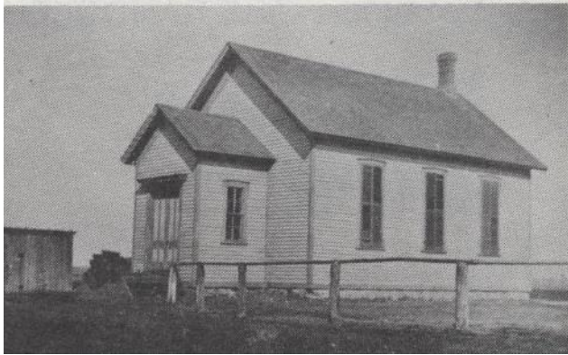
Sketch of first church 1876