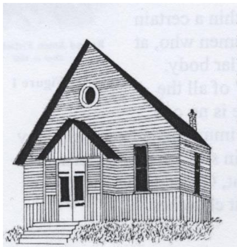
Building used 1884-1910