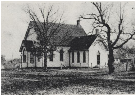
First church building

Miscellaneous correspondence; assorted photos