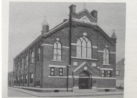
Built in 1887