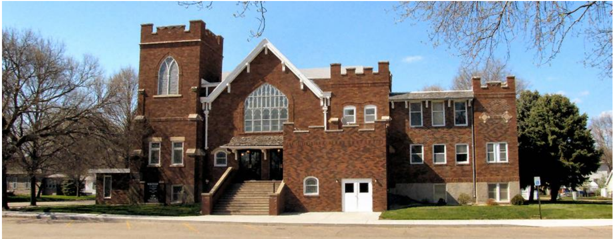
Current building – original construction 1921