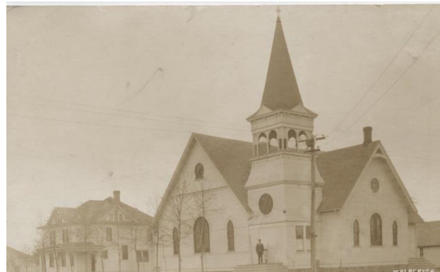
2 nd building - 1902