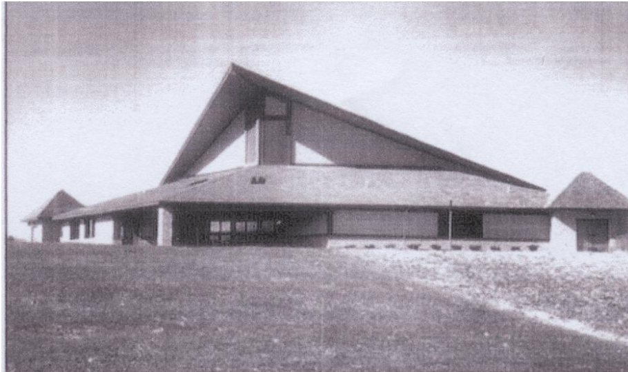
Building dedicated 1993