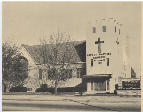
Ripley Avenue building