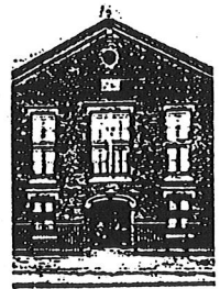
The Church of the Lord that Meets on Poplar Street, the first meeting place of the present Fleischman Memorial Baptist Church.