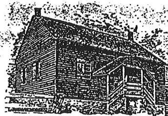
Tunker Church, Blooming Grove, Pa. Built in 1828