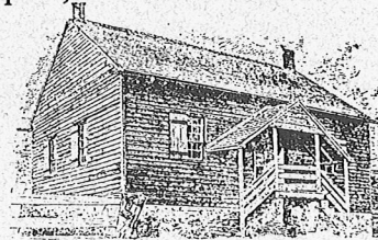
Tunker Church, Blooming Grove, Pa. Built in 1828

The Conference dates its beginning to 1843 when Fleischmann Baptist Church of Philadelphia, PA. was founded.