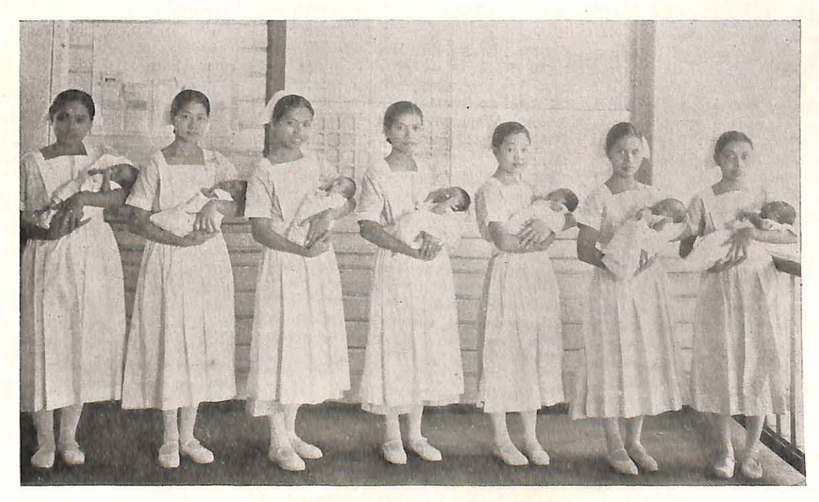
Members of the Class of 1937