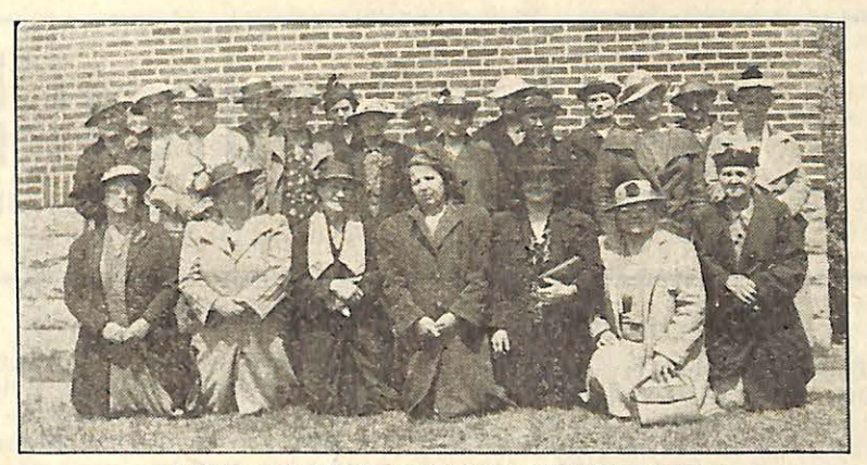
A Women's Missionary Society Met For Prayer