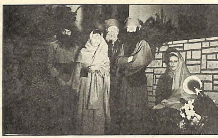
Cast of Characters of the Carroll Ave. Church of Dallas, Texas, for the Play, "The Fishermen."