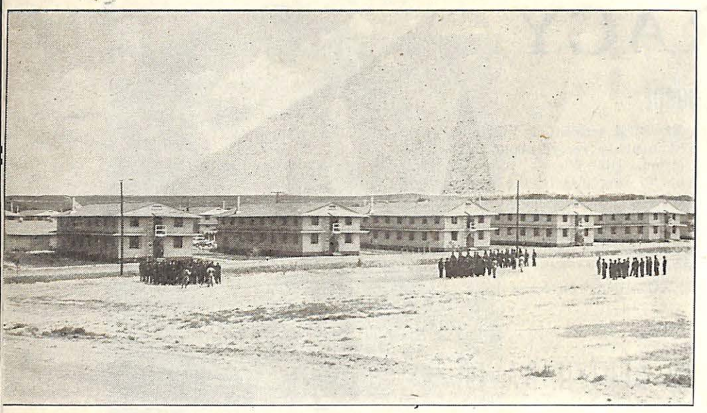
A General View of Fort Riley, Kansas, Where Several of the Young Men of Our Churches