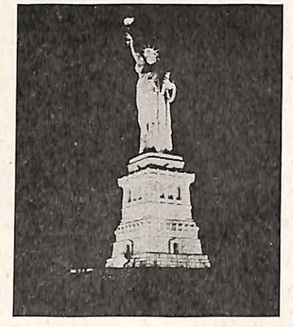
The Statue of Liberty Symbolizing Its Message of Freedom and Peace in the Midst of a World of Darkness

"Give me your tired. Your poor, Your huddled masses yearning to breathe free, The wretched refuse of your teeming shore. Send these, the homeless, tempest-tost to me, I lift my lamp beside the golden door!"