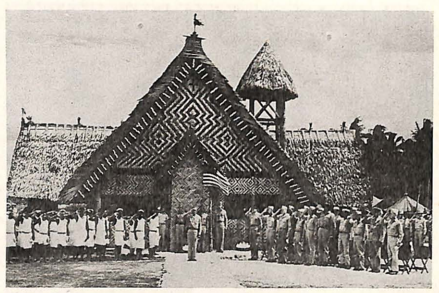
Guadalcanal Island Natives, Grateful for Their Liberation from the Japanese, Built this Memorial Chapel, Handcarved and Inlaid with Mother-of-Pearl and Presented It to the People of America as Their Tribute to the Memory of the Brave Men Who Died There.