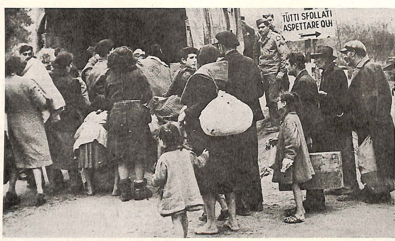
Refugees, Some of Them Barefoot, Each Carrying a Tiny Bundle of Possessions, Wait to Board a Truck That Will Take Them to Safety After They Have Been Given Food and Drink.