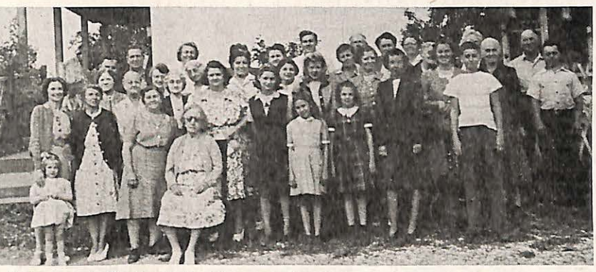
Ladies' Aid Picnic of the East Baptist Church of Wilmington, Delaware, Held at the Ehm Farm