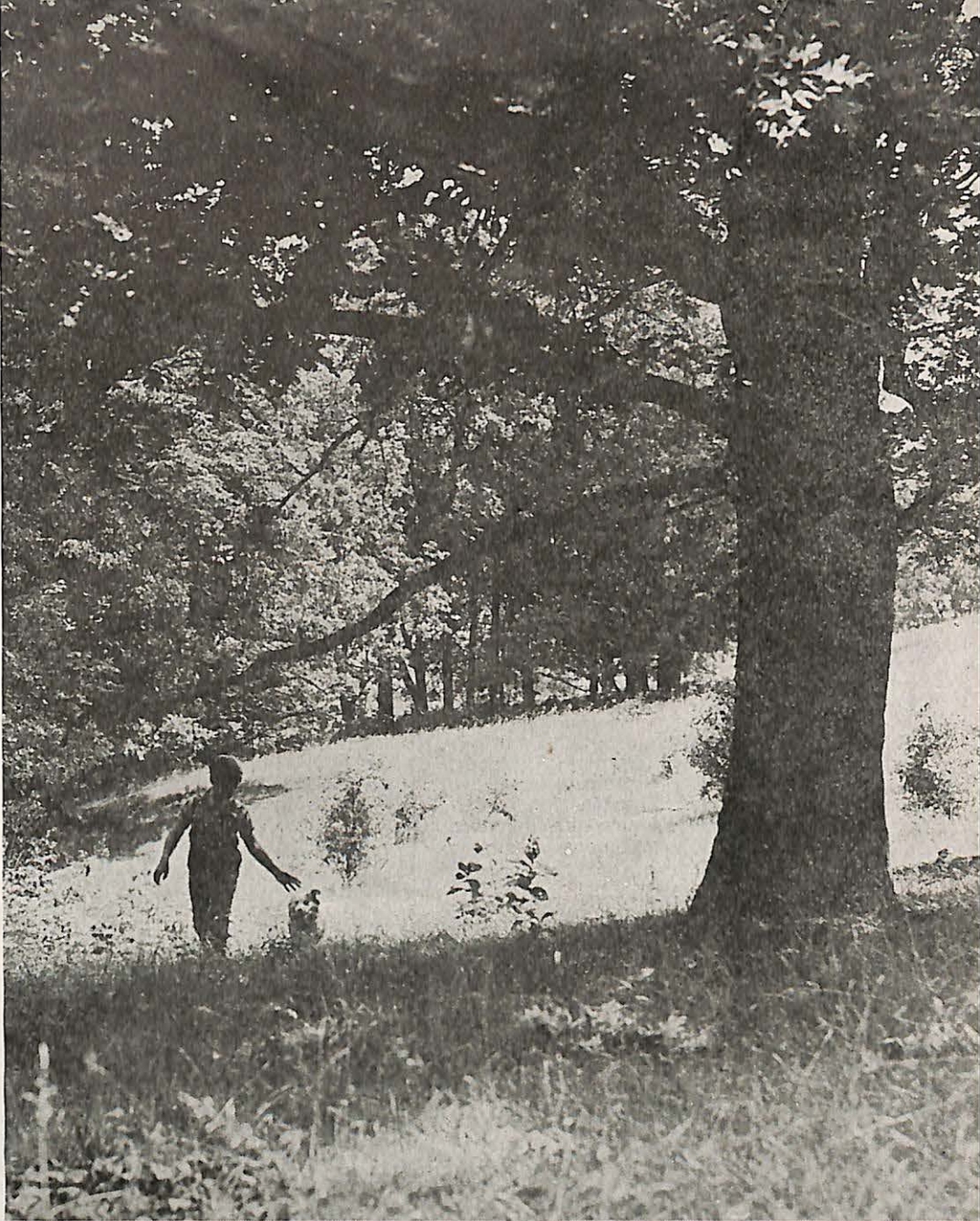
A Boy and His Dog Are the Best Pals Anywhere