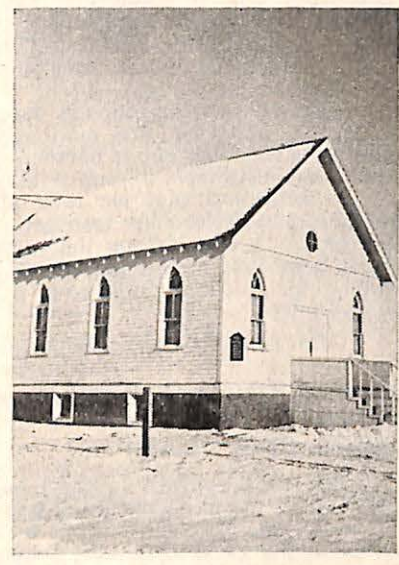
The Former Bethel Baptist Church of Alberta, the Congregation of Which Is Now a Part of the New, Amalgamated Carbon Baptist Church