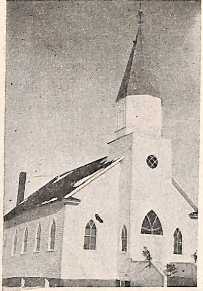
Former Freudental Baptist Church of Alberta, the Congregation of Which Is Now a Part of the New, Amalgamated Carbon Baptist Church