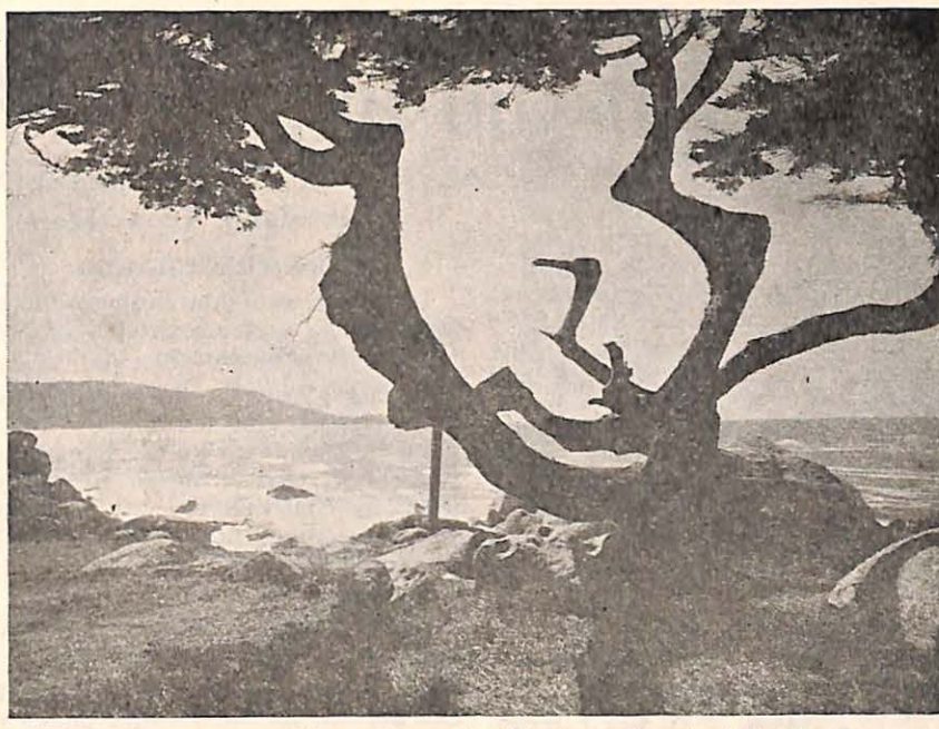
Weather-beaten Pines Along the Monterey Coast of California

A magnet has been in my possession for many years. It has not lost its power. It still lays hold of the iron bar with the firm grip of invisible hands. I can still transform a needle into a compass by rubbing it against the magnet. When the old question arises, "How can these things be?" I get hold of the magnet and pull the bar from its grip and let it click back, drawn by the magnet's power. It will even hold the bar through several thicknesses of paper. How can that be? I can see no power.