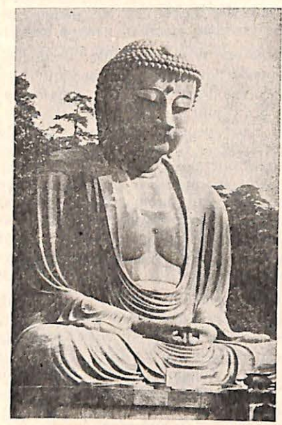
The Buddha Image or Daibutsu at Kamakura, Japan

Then on Sunday, September 2, we of the monastery in 1495 A. D., but observed our first church service in notwithstanding the ravages of time and the fury of the elements, it is in a state of excellent preservation and repair. It is 12.89 meters in height and