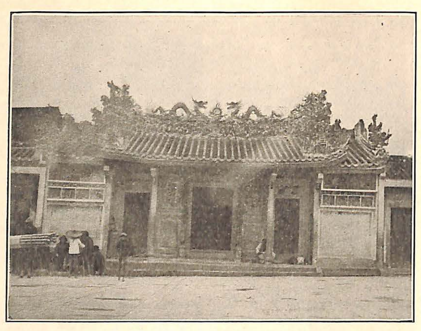
Buddhist Temple in Swatow, China