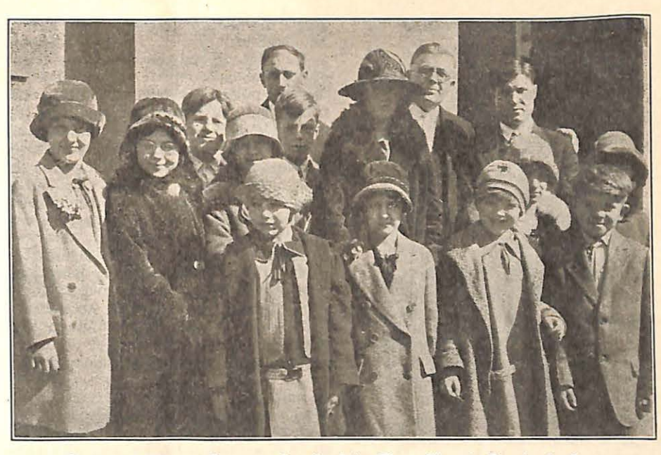
Group of Young Converts baptized in First Church Portland, Oreg.

In looking back, we believe the year was a successful one and with God's help we hope to be able to do more for him in our society and to gain in number as well as in faith.