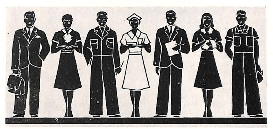
The Baptist Jubilee Advance is people . . . "the people called Baptists" . . . 18 million of them in the United States and Canada.