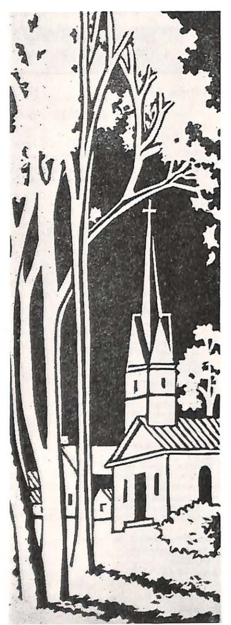
"The Holy Spirit has appointed every

OULS, countless precious souls, as a mighty river, are rushing down to a Christless eternity, for these are swiftly moving days and Satanic influence is at every hand. And we stand idly by! They are lost, eternally lost, and we lift not a hand to turn them from this tide of destruction. Dramatic, you say! Ah yes, but nonetheless true, for life itself is the greatect drama of all.