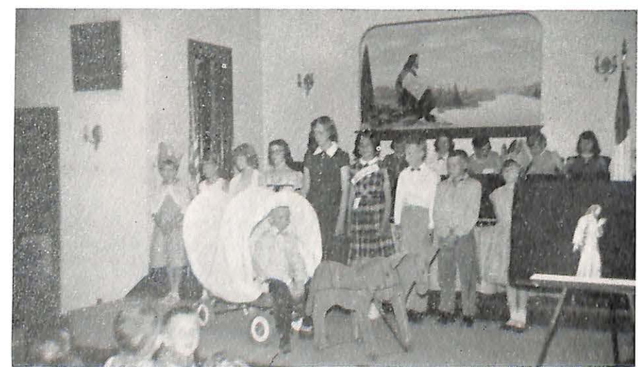
Vacation Bible School children of the Alfred and Gackle, N. Dak., churches at the demonstration program held in the Gackle Church on Sunday evening, June 9.