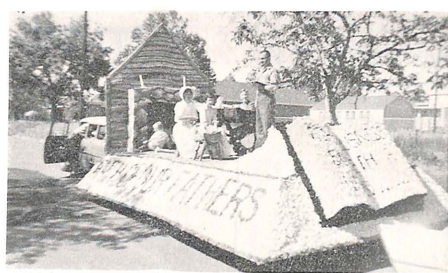
The religious float entered by the First Baptist Church, Elk Grove, Calif., in a community parade celebrating Elk Grove's Western Festival. The float won first prize as "the most outstanding entry."