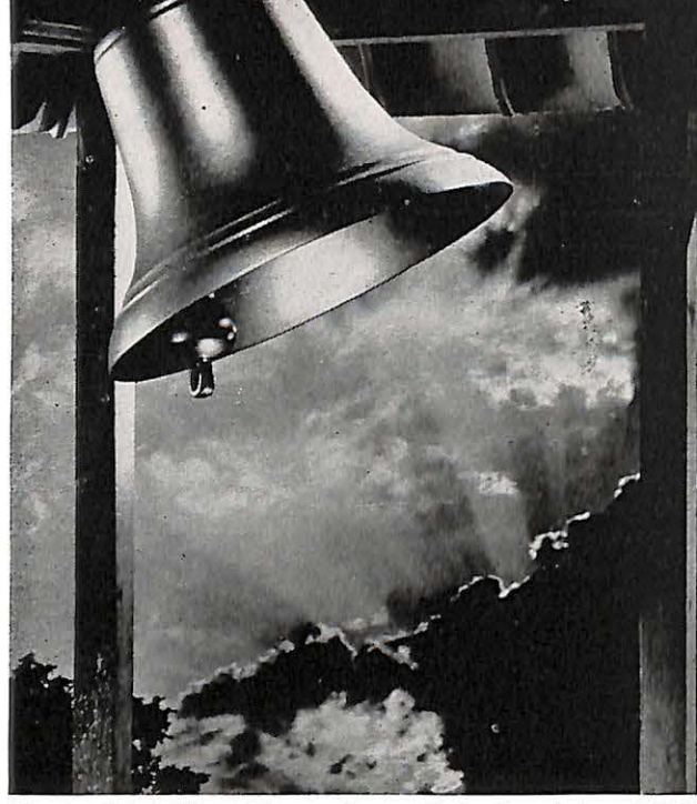
The Baptist Jubilee Advance is a united attempt to quicken within professed believers in Christ a sense of responsibility for carrying out with zeal all phases of the Great Commission of Christ.

1 a movement in which the major Baptist fellowships of North America are cooperating to reach all the people with the full force of their Christian witness.